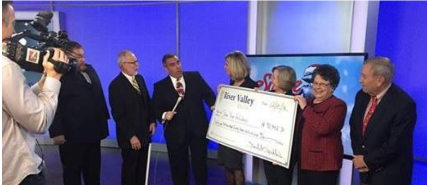
Check presentation.